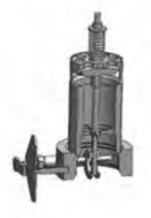
Manual Manual external handle with locking device

Standard Actuated Reset Heavy duty spring and seat design, Pneumatic or hydraulic reset Optional weep hole