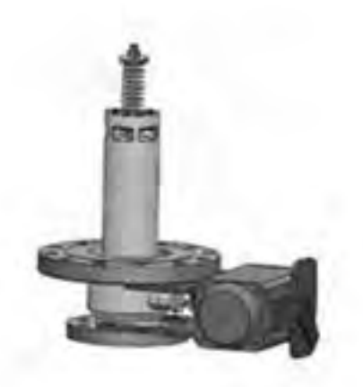
Custom Custom inlets and outlets, start-up and shutdown options available